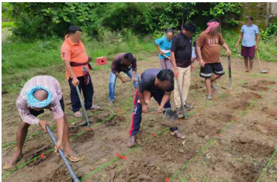
OPPOSITE: joint Thirdmill/EFI training event; new Bible training center ABOVE: Thirdmill students learn sustainable farming techniques through EFI

We couldn’t be more delighted to be a part of his journey!