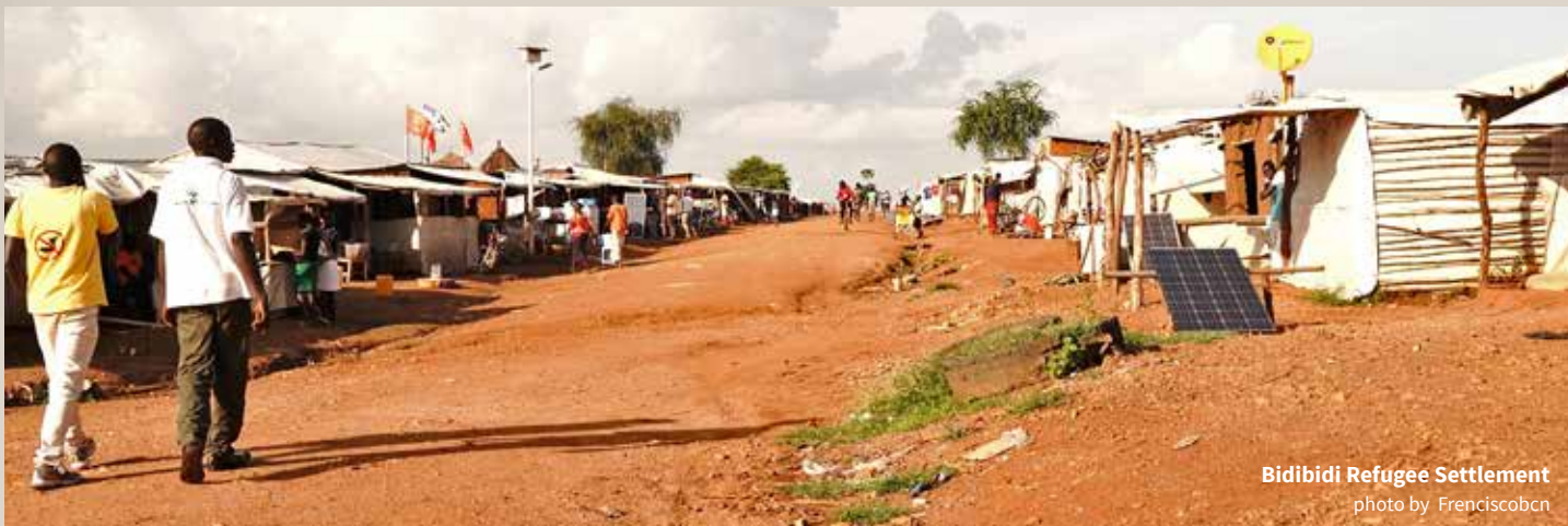
Bidibidi Refugee Settlement