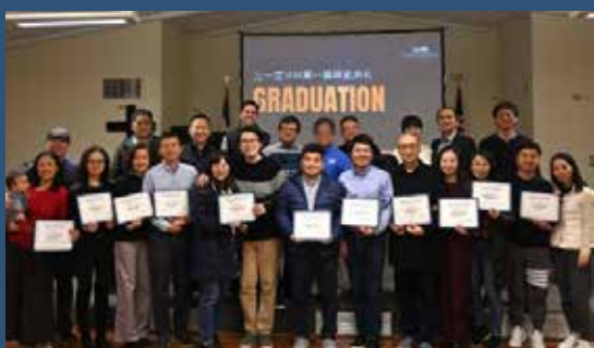
Graduates of TCC's Thirdmill Institute training show off their certificates.