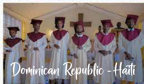
Dominican Republic - Haiti